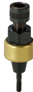
Nose piece with threaded mandrel (M4, M5 oder M6)