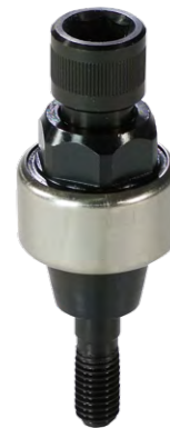
Setting head with threaded mandrel (M8, M10 or M12)